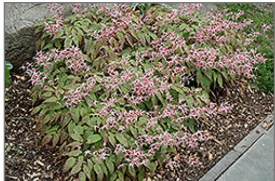
Pink Champagne Fairy Wings in bloom