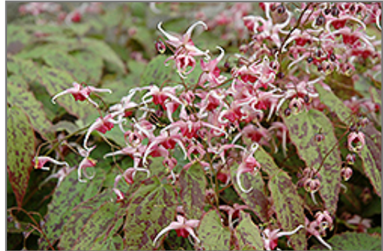
Pink Champagne Fairy Wings flowers

Pink Champagne Fairy Wings is a dense herbaceous perennial with a ground-hugging habit of growth. Its relatively fine texture sets it apart from other garden plants with less refined foliage.