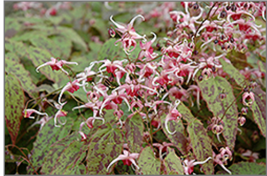
Pink Champagne Fairy Wings flowers

Pink Champagne Fairy Wings is a dense herbaceous perennial with a ground-hugging habit of growth. Its relatively fine texture sets it apart from other garden plants with less refined foliage.