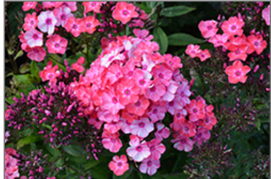
Garden Girls Glamour Girl Garden Phlox flowers

Garden Girls Glamour Girl Garden Phlox is recommended for the following landscape applications;