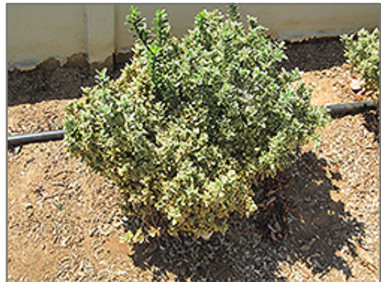
Variegated Boxleaf Japanese Euonymus