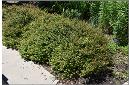
Rose Creek Abelia

Rose Creek Abelia will grow to be about 4 feet tall at maturity, with a spread of 5 feet. It tends to fill out right to the ground and therefore doesn't necessarily require facer plants in front. It grows at a slow rate, and under ideal conditions can be expected to live for approximately 30 years.