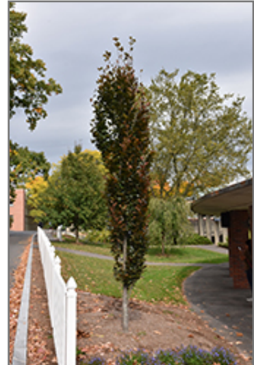
Dawyck Purple Beech

Dawyck Purple Beech is recommended for the following landscape applications;