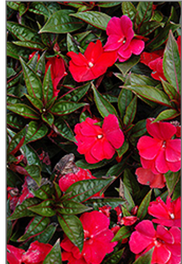
Divine Scarlet Bronze Leaf New Guinea Impatiens flowers

This plant will require occasional maintenance and upkeep, and should not require much pruning, except when necessary, such as to remove dieback. It has no significant negative characteristics.