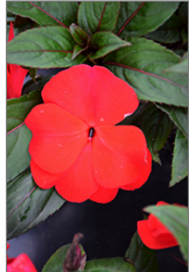
Divine Scarlet Bronze Leaf New Guinea Impatiens flowers

This plant will require occasional maintenance and upkeep, and should not require much pruning, except when necessary, such as to remove dieback. It has no significant negative characteristics.