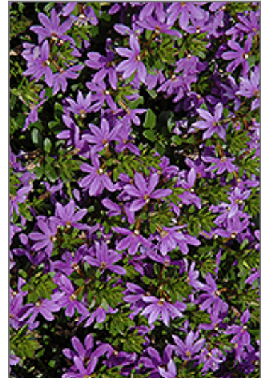
Brilliant Fan Flower flowers