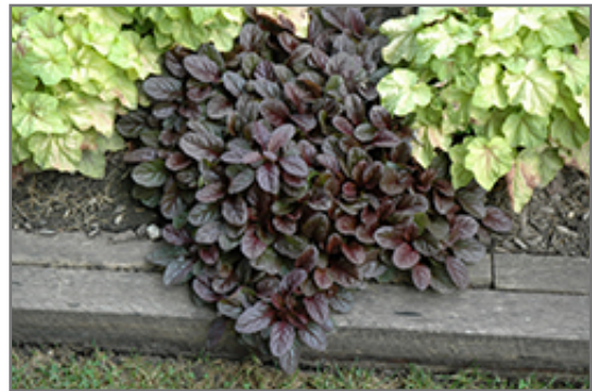
Mahogany Bugleweed