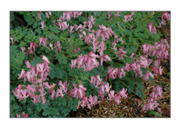
Amore Pink Bleeding Heart in bloom