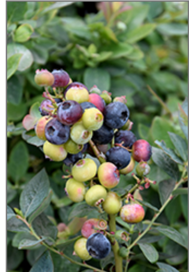
Pink Icing Blueberry fruit

Pink Icing Blueberry features dainty clusters of white bell-shaped flowers with shell pink overtones hanging below the branches in mid spring, which emerge from distinctive pink flower buds. It has bluish-green deciduous foliage which emerges pink in spring. The glossy oval leaves turn an outstanding aqua bluish-green in the fall. It features an abundance of magnificent blue berries in mid summer.