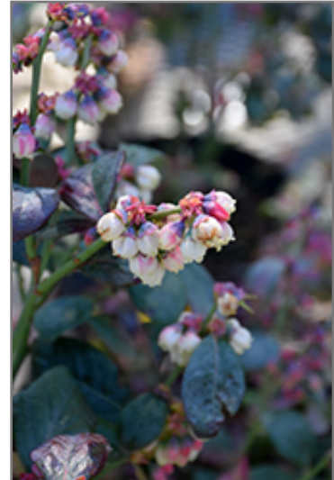
Pink Icing Blueberry flowers

This shrub is quite ornamental as well as edible, and is as much at home in a landscape or flower garden as it is in a designated edibles garden. It does best in full sun to partial shade. It does best in average to evenly moist conditions, but will not tolerate standing water. It is very fussy about its soil conditions and must have sandy, acidic soils to ensure success, and is subject to chlorosis (yellowing) of the foliage in alkaline soils. It is quite intolerant of urban pollution, therefore inner city or urban streetside plantings are best avoided, and will benefit from being planted in a relatively sheltered location. Consider applying a thick mulch around the root zone in winter to protect it in exposed locations or colder microclimates. This particular variety is an interspecific hybrid.