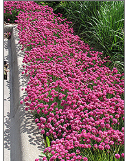
Dusseldorf Pride Sea Thrift in bloom

Dusseldorf Pride Sea Thrift is recommended for the following landscape applications;