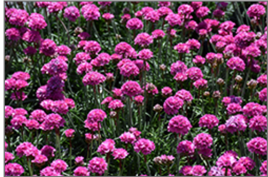
Dusseldorf Pride Sea Thrift flowers

Dusseldorf Pride Sea Thrift will grow to be only 6 inches tall at maturity extending to 8 inches tall with the flowers, with a spread of 8 inches. Its foliage tends to remain low and dense right to the ground. It grows at a slow rate, and under ideal conditions can be expected to live for approximately 10 years. As an evergreen perennial, this plant will typically keep its form and foliage year-round.