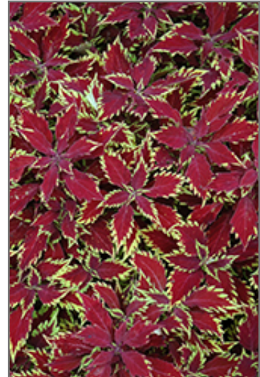
ColorBlaze Royale Apple Brandy Coleus foliage

ColorBlaze Royale Apple Brandy Coleus is recommended for the following landscape applications;