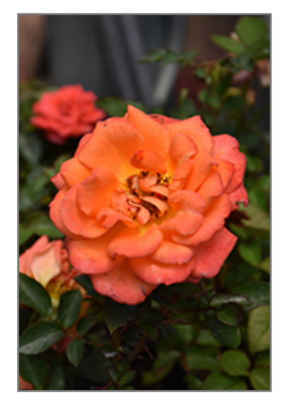
Sunblaze Amber Rose flowers