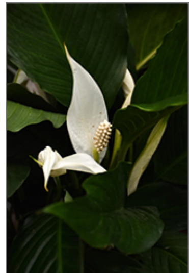
Peace Lily flowers