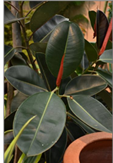
Rubber Tree foliage

When grown indoors, Rubber Tree can be expected to grow to be about 7 feet tall at maturity, with a spread of 5 feet. It grows at a medium rate, and under ideal conditions can be expected to live for approximately 50 years. This houseplant performs well in both bright or indirect sunlight and strong artificial light, and can therefore be situated in almost any well-lit room or location. It prefers dry to average moisture levels with very well-drained soil, and may die if left in standing water for any length of time. This plant should be watered when the surface of the soil gets dry, and will need watering approximately once each week. Be aware that your particular watering schedule may vary depending on its location in the room, the pot size, plant size and other conditions; if in doubt, ask one of our experts in the store for advice. It is not particular as to soil type or pH; an average potting soil should work just fine.