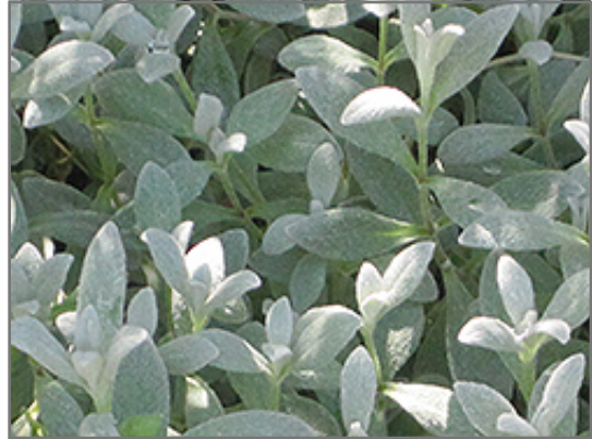
Snow-In-Summer foliage

Snow-In-Summer will grow to be about 8 inches tall at maturity, with a spread of 24 inches. Its foliage tends to remain low and dense right to the ground. It grows at a fast rate, and under ideal conditions can be expected to live for approximately 10 years.