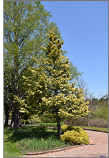
Cripps Gold Falsecypress

This tree does best in full sun to partial shade. It prefers to grow in average to moist conditions, and shouldn't be allowed to dry out. It is not particular as to soil type or pH. It is highly tolerant of urban pollution and will even thrive in inner city environments, and will benefit from being planted in a relatively sheltered location. Consider applying a thick mulch around the root zone in winter to protect it in exposed locations or colder microclimates. This is a selected variety of a species not originally from North America.