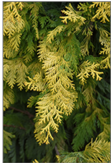
Cripps Gold Falsecypress foliage