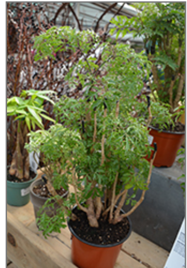
Ming Aralia

This is a dense multi-stemmed evergreen houseplant with an upright spreading habit of growth. Its extremely fine and delicate texture is quite ornamental and should be used to full effect. This plant can be pruned at any time to keep it looking its best.