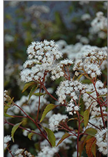
Chocolate Boneset flowers