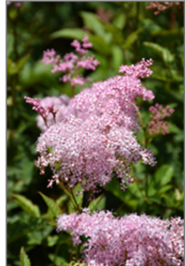
Queen Of The Prairie flowers