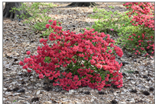
Girard's Crimson Azalea in bloom