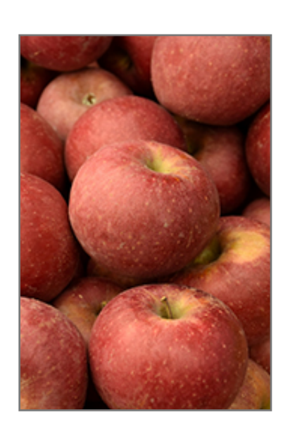
Winesap Apple fruit

This is a deciduous tree with a more or less rounded form. Its average texture blends into the landscape, but can be balanced by one or two finer or coarser trees or shrubs for an effective composition. This is a high maintenance plant that will require regular care and upkeep, and is best pruned in late winter once the threat of extreme cold has passed. Gardeners should be aware of the following characteristic(s) that may warrant special consideration;