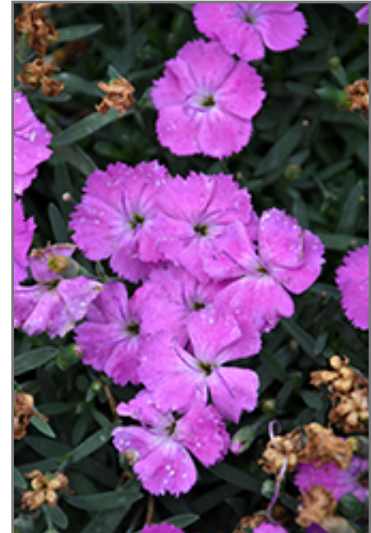
Paint The Town Fuchsia Pinks flowers

Paint The Town Fuchsia Pinks is an herbaceous evergreen perennial with a mounded form. It brings an extremely fine and delicate texture to the garden composition and should be used to full effect.