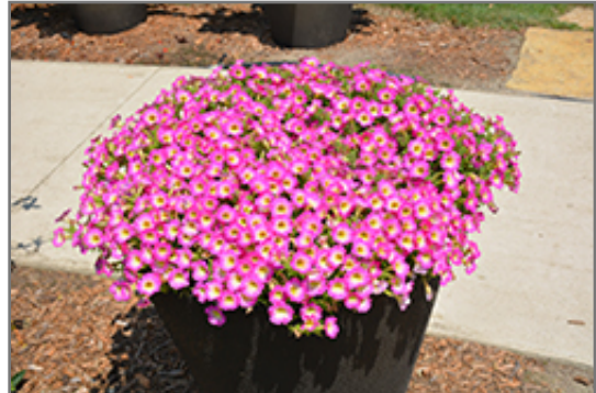
Supertunia Daybreak Charm Petunia in bloom

Supertunia Daybreak Charm Petunia is a fine choice for the garden, but it is also a good selection for planting in outdoor containers and hanging baskets. Because of its trailing habit of growth, it is ideally suited for use as a 'spiller' in the 'spiller-thriller-filler' container combination; plant it near the edges where it can spill gracefully over the pot. Note that when growing plants in outdoor containers and baskets, they may require more frequent waterings than they would in the yard or garden.