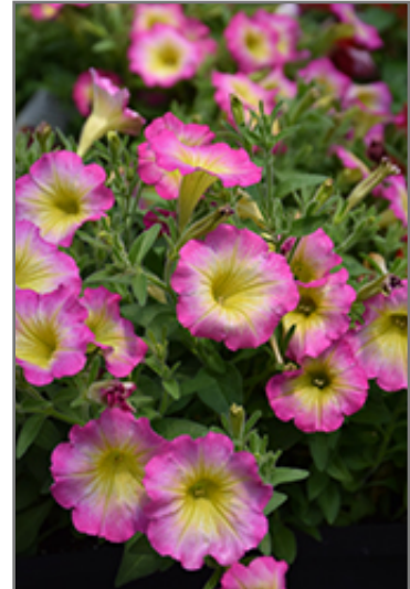
Supertunia Daybreak Charm Petunia flowers

Supertunia Daybreak Charm Petunia is a dense herbaceous annual with a trailing habit of growth, eventually spilling over the edges of hanging baskets and containers. Its medium texture blends into the garden, but can always be balanced by a couple of finer or coarser plants for an effective composition.