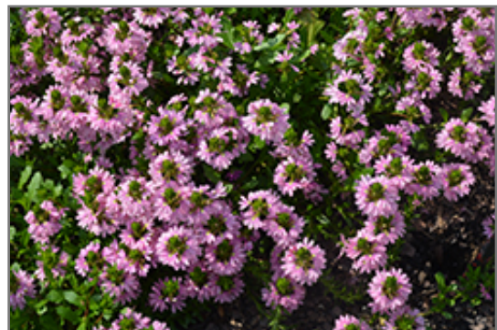
Whirlwind Pink Fan Flower flowers