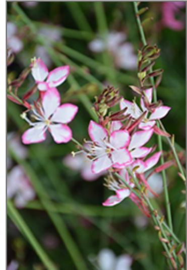
Rosy Jane Gaura flowers

Rosy Jane Gaura is recommended for the following landscape applications;