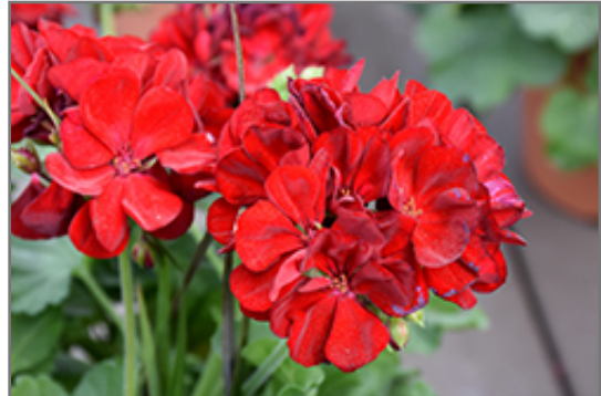
Calliope Medium Dark Red Geranium flowers

Calliope Medium Dark Red Geranium is recommended for the following landscape applications;