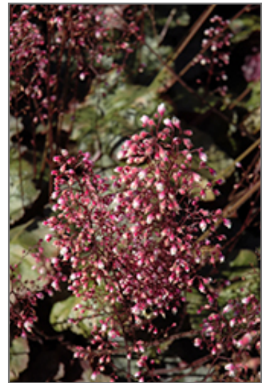
Frosted Violet Coral Bells flowers