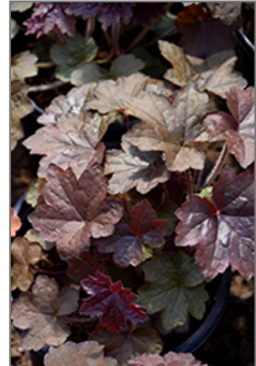
Palace Purple Coral Bells foliage

Palace Purple Coral Bells is recommended for the following landscape applications;