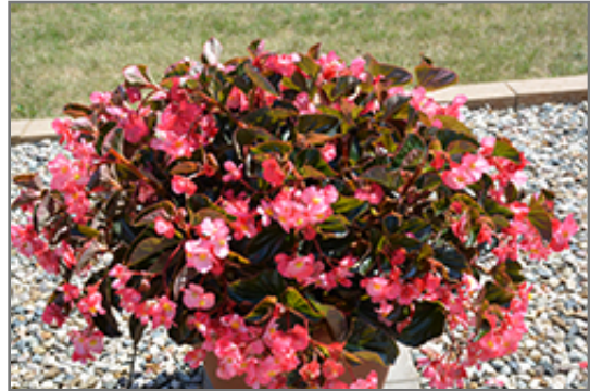
Megawatt Pink Bronze Leaf Begonia in bloom

Megawatt Pink Bronze Leaf Begonia is a fine choice for the garden, but it is also a good selection for planting in outdoor containers and hanging baskets. With its upright habit of growth, it is best suited for use as a 'thriller' in the 'spiller-thriller-filler' container combination; plant it near the center of the pot, surrounded by smaller plants and those that spill over the edges. It is even sizeable enough that it can be grown alone in a suitable container. Note that when growing plants in outdoor containers and baskets, they may require more frequent waterings than they would in the yard or garden.