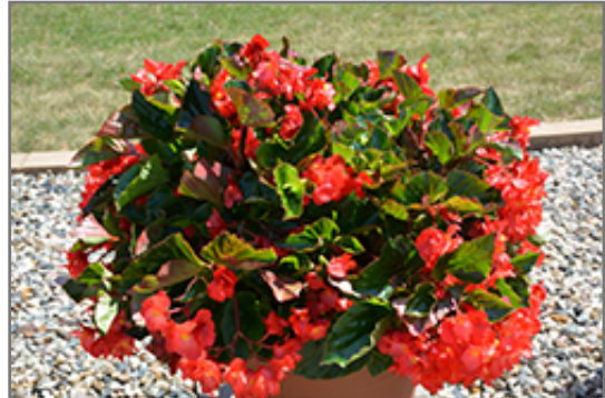
Megawatt Red Green Leaf Begonia in bloom

Megawatt Red Green Leaf Begonia is a fine choice for the garden, but it is also a good selection for planting in outdoor containers and hanging baskets. With its upright habit of growth, it is best suited for use as a 'thriller' in the 'spiller-thriller-filler' container combination; plant it near the center of the pot, surrounded by smaller plants and those that spill over the edges. It is even sizeable enough that it can be grown alone in a suitable container. Note that when growing plants in outdoor containers and baskets, they may require more frequent waterings than they would in the yard or garden.