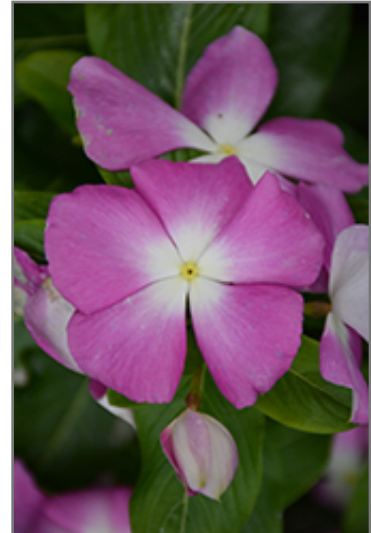
Mega Bloom Orchid Halo Vinca flowers

Mega Bloom Orchid Halo Vinca is a dense herbaceous annual with a mounded form. Its medium texture blends into the garden, but can always be balanced by a couple of finer or coarser plants for an effective composition.