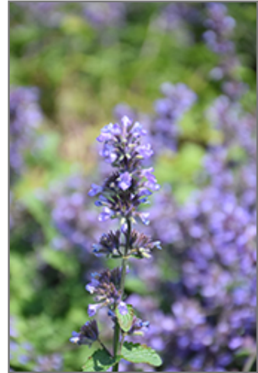
Cat's Pajamas Catmint flowers

Cat's Pajamas Catmint is recommended for the following landscape applications;