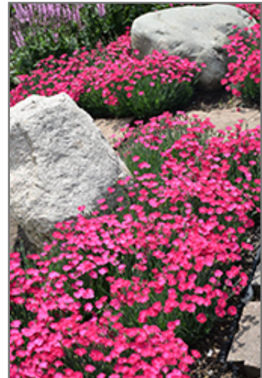
Paint The Town Magenta Pinks in bloom

Paint The Town Magenta Pinks is an herbaceous evergreen perennial with a mounded form. It brings an extremely fine and delicate texture to the garden composition and should be used to full effect.