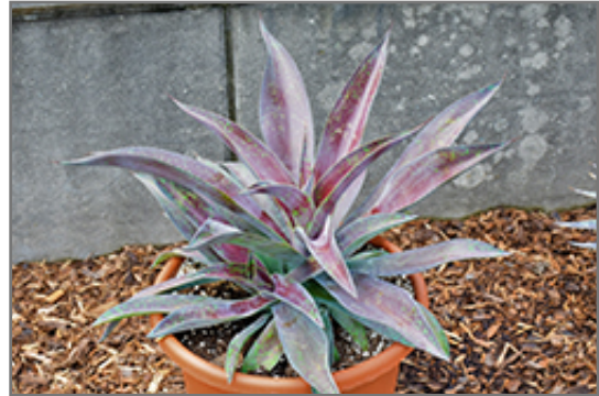
Mission to Mars Mangave

Mission to Mars Mangave will grow to be about 10 inches tall at maturity, with a spread of 22 inches. It grows at a fast rate, and under ideal conditions can be expected to live for approximately 5 years. As an herbaceous perennial, this plant will usually die back to the crown each winter, and will regrow from the base each spring. Be careful not to disturb the crown in late winter when it may not be readily seen!