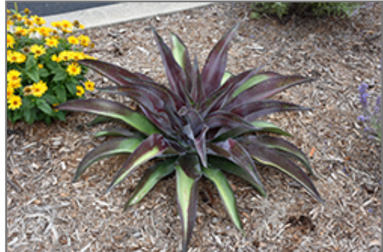
Mission to Mars Mangave

This is a relatively low maintenance plant, and is best cleaned up in early spring before it resumes active growth for the season. Deer don't particularly care for this plant and will usually leave it alone in favor of tastier treats. It has no significant negative characteristics.