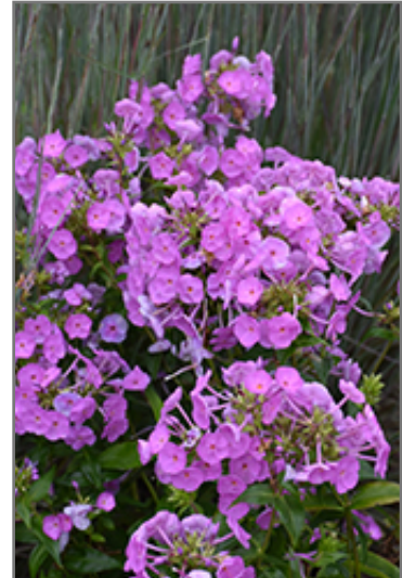
Fashionably Early Flamingo Garden Phlox flowers

This plant will require occasional maintenance and upkeep, and should be cut back in late fall in preparation for winter. It is a good choice for attracting butterflies and hummingbirds to your yard. Gardeners should be aware of the following characteristic(s) that may warrant special consideration;