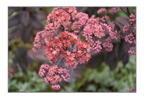
Night Embers Stonecrop flowers