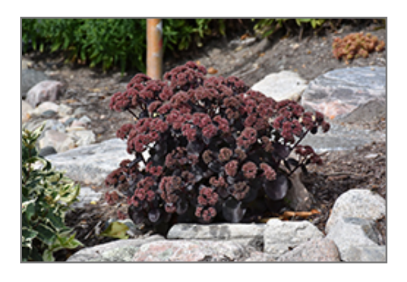
Night Embers Stonecrop in bloom

Night Embers Stonecrop is a dense herbaceous perennial with an upright spreading habit of growth. Its relatively coarse texture can be used to stand it apart from other garden plants with finer foliage.