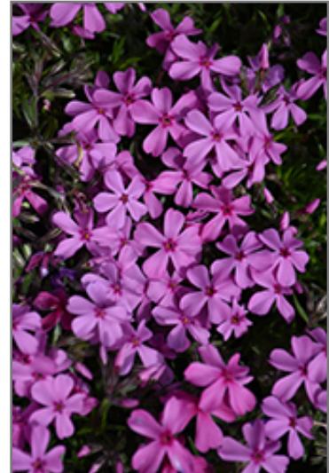
Spring Dark Pink Moss Phlox flowers