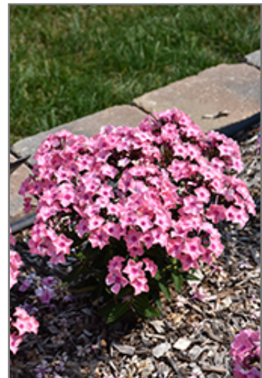
Sweet Summer Queen Garden Phlox in bloom