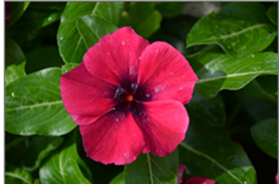
Tattoo Black Cherry Vinca flowers

Tattoo Black Cherry Vinca is a dense herbaceous annual with a mounded form. Its medium texture blends into the garden, but can always be balanced by a couple of finer or coarser plants for an effective composition.