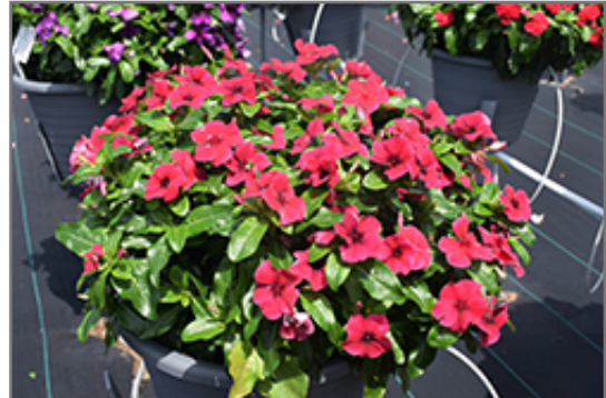
Tattoo Black Cherry Vinca in bloom