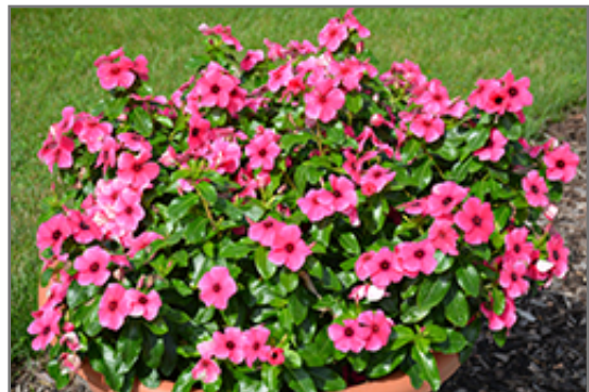
Tattoo Raspberry Vinca in bloom