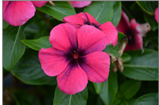
Tattoo Raspberry Vinca flowers

Tattoo Raspberry Vinca is a dense herbaceous annual with a mounded form. Its medium texture blends into the garden, but can always be balanced by a couple of finer or coarser plants for an effective composition.