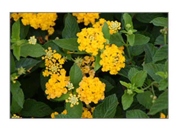
Luscious Goldengate Lantana flowers

This variety produces a vibrant display of golden-yellow blooms; extremely tough plants that are heat and drought tolerant; great for beds, borders, and containers