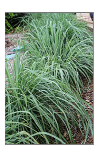
Lemon Grass

Lemon Grass will grow to be about 4 feet tall at maturity, with a spread of 30 inches. Although it's not a true annual, this fast-growing plant can be expected to behave as an annual in our climate if left outdoors over the winter, usually needing replacement the following year. As such, gardeners should take into consideration that it will perform differently than it would in its native habitat.