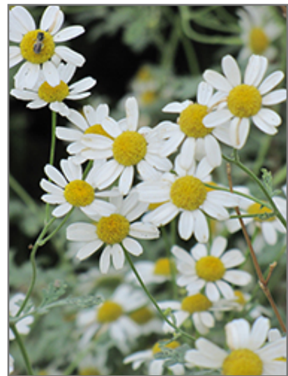
German Chamomile flowers