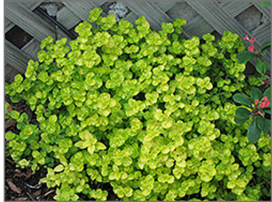
Golden Oregano

Aside from its primary use as an edible, Golden Oregano is suitable for the following landscape applications;