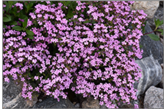
Rock Soapwort in bloom