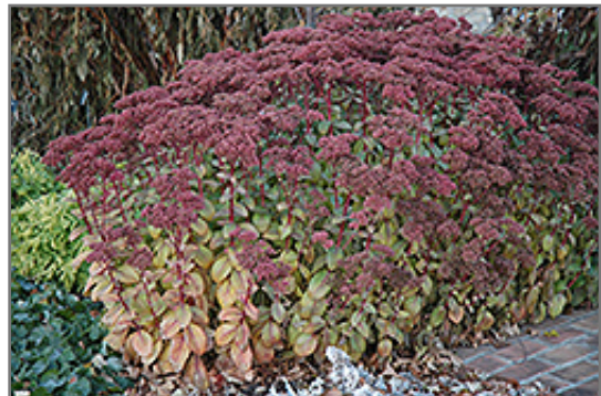
Matrona Stonecrop in fall