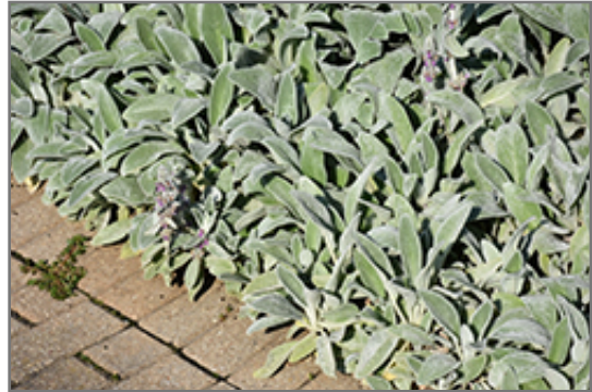
Lamb's Ears

Lamb's Ears is a fine choice for the garden, but it is also a good selection for planting in outdoor pots and containers. It can be used either as 'filler' or as a 'thriller' in the 'spiller-thriller-filler' container combination, depending on the height and form of the other plants used in the container planting. Note that when growing plants in outdoor containers and baskets, they may require more frequent waterings than they would in the yard or garden.