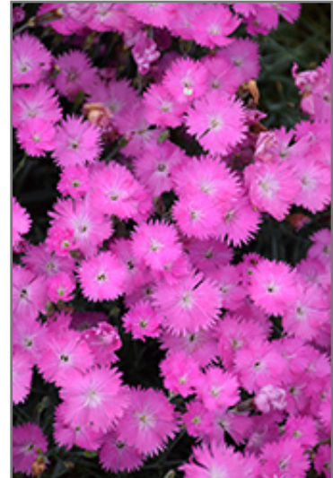
Firewitch Pinks flowers

Firewitch Pinks is recommended for the following landscape applications;