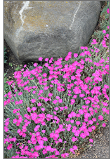
Firewitch Pinks in bloom

Firewitch Pinks is a fine choice for the garden, but it is also a good selection for planting in outdoor pots and containers. It is often used as a 'filler' in the 'spiller-thriller-filler' container combination, providing a mass of flowers and foliage against which the thriller plants stand out. Note that when growing plants in outdoor containers and baskets, they may require more frequent waterings than they would in the yard or garden.