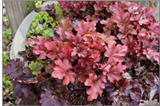
Peach Flambe Coral Bells