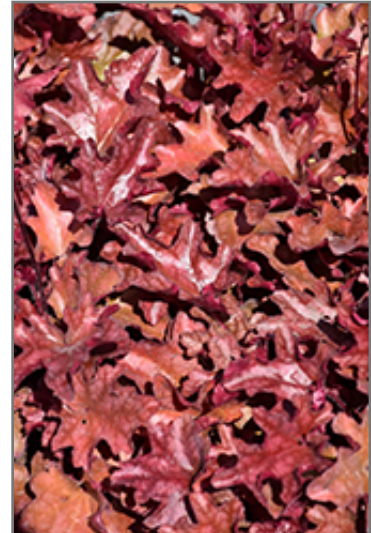
Peach Flambe Coral Bells foliage

Peach Flambe Coral Bells is a dense herbaceous evergreen perennial with tall flower stalks held atop a low mound of foliage. Its relatively fine texture sets it apart from other garden plants with less refined foliage.